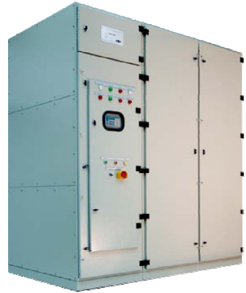
MV Soft-Starter, HRVS-DN 10KV-240A

3 Fan Multi-start Motor ratings: 10000V, 167A Cherepovetz Russia - Severstahl Steel factory