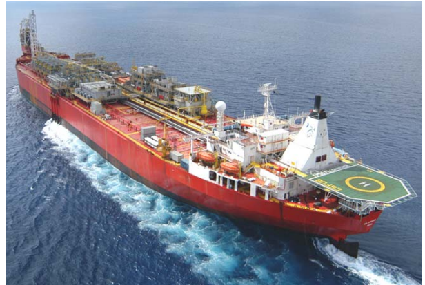
FPSO Fluminense – Operated by Shell

Driving seawater injection pumps, gas compressor etc. Motor ratings: 6600V, 400A FPSO- Fluminense