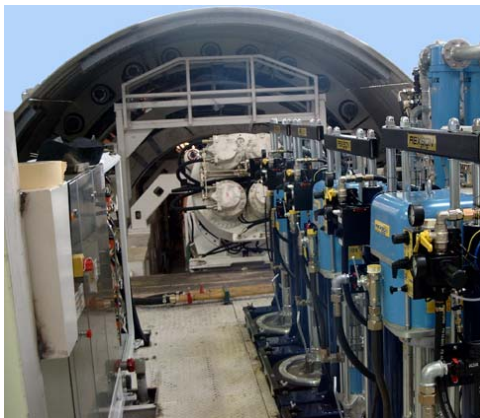
VATECH Hydraulic Motors

Solcon came through with another major advantage in this application by using the Solcon Multi Motor Starting system. One Solcon soft-starter starts all 8 motors using two sets of starting characteristics for the 2 different types of hydraulic motors. Solcon offers not only the highest quality, long term reliability and the ultimate motor and starter protection, but also savings in initial capital investment, engineering costs,